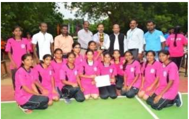
Kakatiya University Inter Collegiate Tournaments Basketball (W) Winners KITS Wgl.