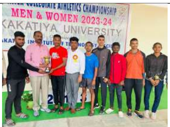
Men Championship won by Govt. SR&BGNR, Khammam.