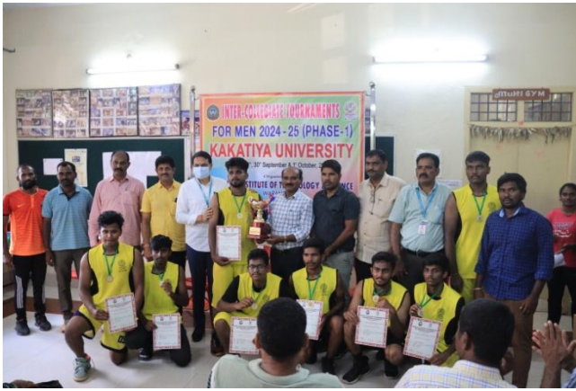
Kakatiya University Inter Collegiate Tournaments Basketball(M) Runners-Up KITS Wgl-2024-25